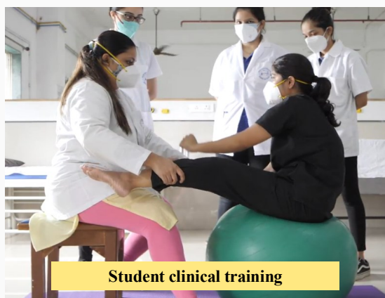
Student clinical training